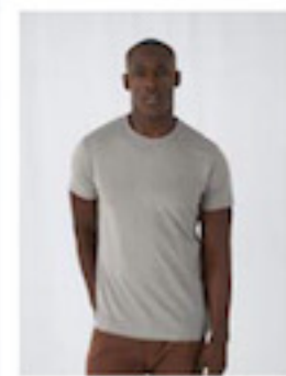
DUO CONCEPT with B&C Inspire T /men