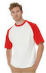
Exists in B&C Base-Ball