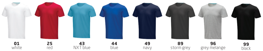
01 white 25 red 43 NXT blue 44 blue 49 navy 89 storm grey 96 grey melange 99 black